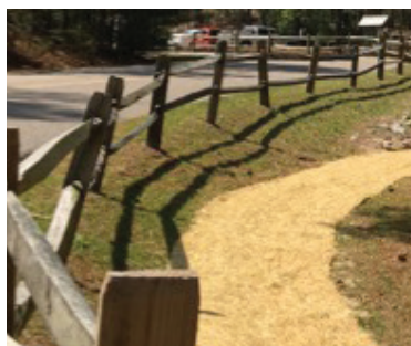
Once the wastewater is ground to slurry by the grinder pump station it is discharged through 11/4" HDPE dr11 pipe.